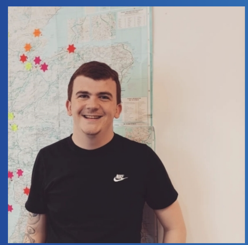
Highlands and Islands Students' Association